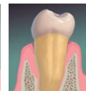
A Thoroughly Clean Root Surface Leads to a Healthy Tissue Response

For the first time, clinicians using the dental endoscope can see magnified details of tooth anatomy and deposits below the gumline to diagnose and treat periodontal disease in a minimally-invasive way.